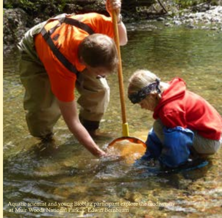
Aquatic scientist and young Bioblitz participant explore the biodiversity at Muir Woods National Park.

We pull on chest waders, new out of the box provided for us at Muir Woods National Park.