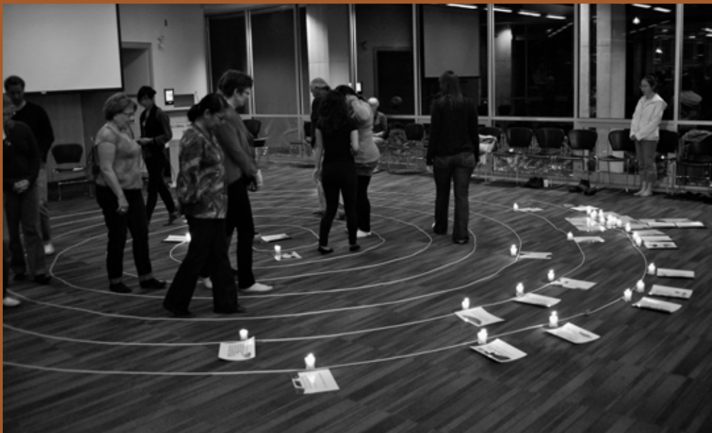
The Earth Literacies Project's Cosmic Walking Meditation.