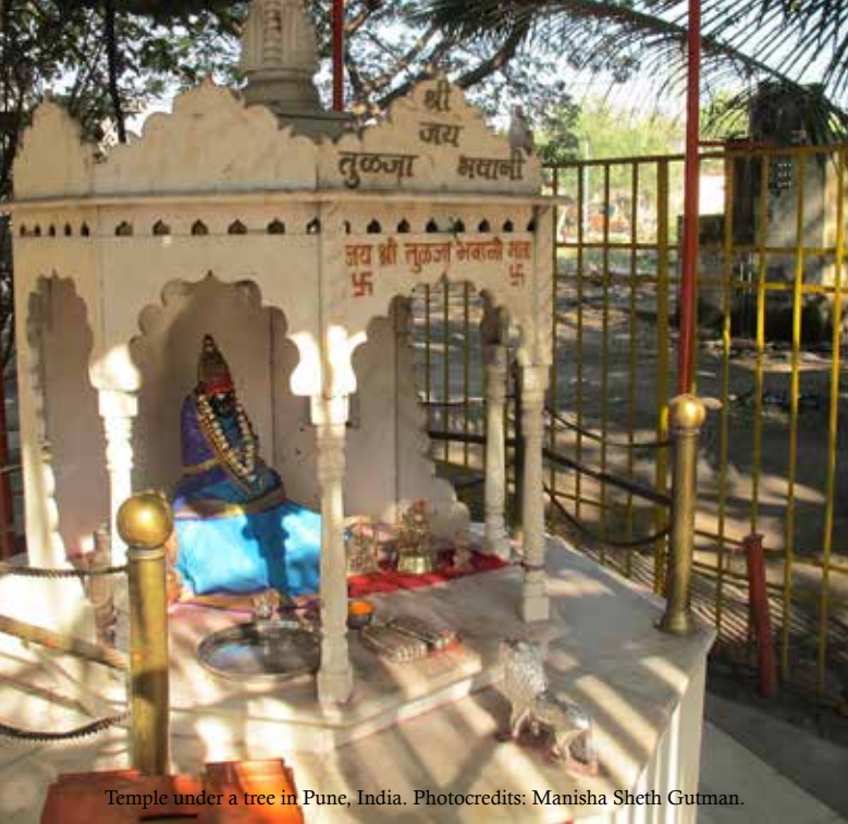
Temple under a tree in Pune, India.