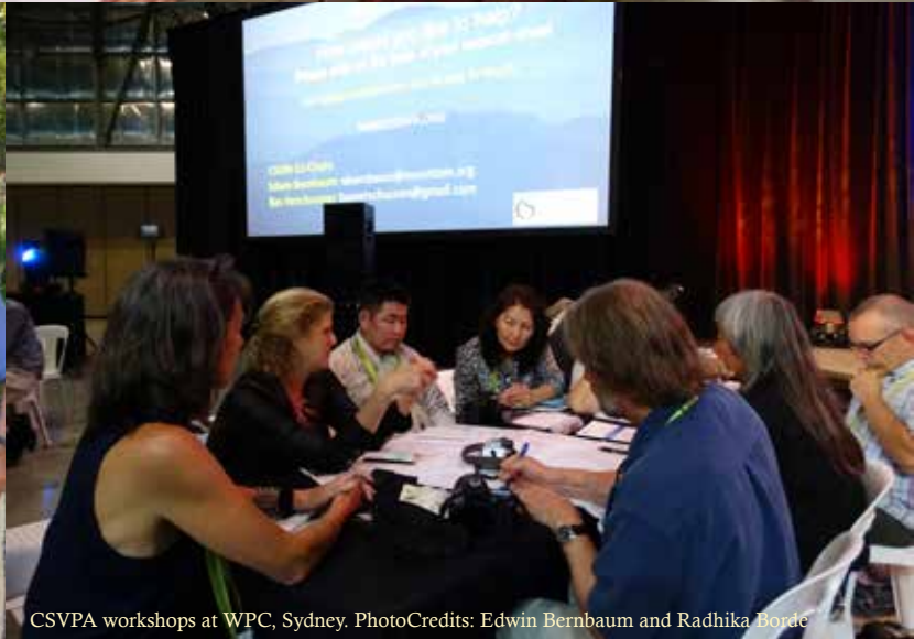
CSVPA members at WPC, Sydney.