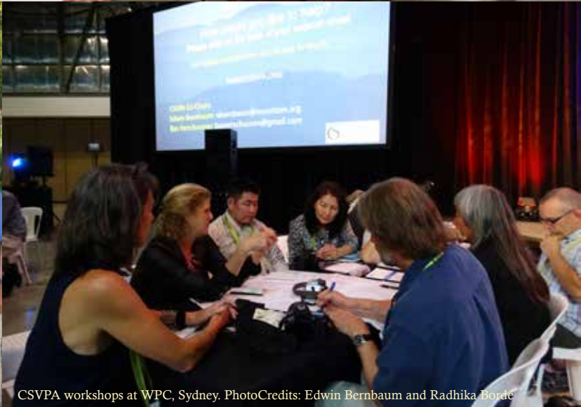
CSVPA members at WPC, Sydney.