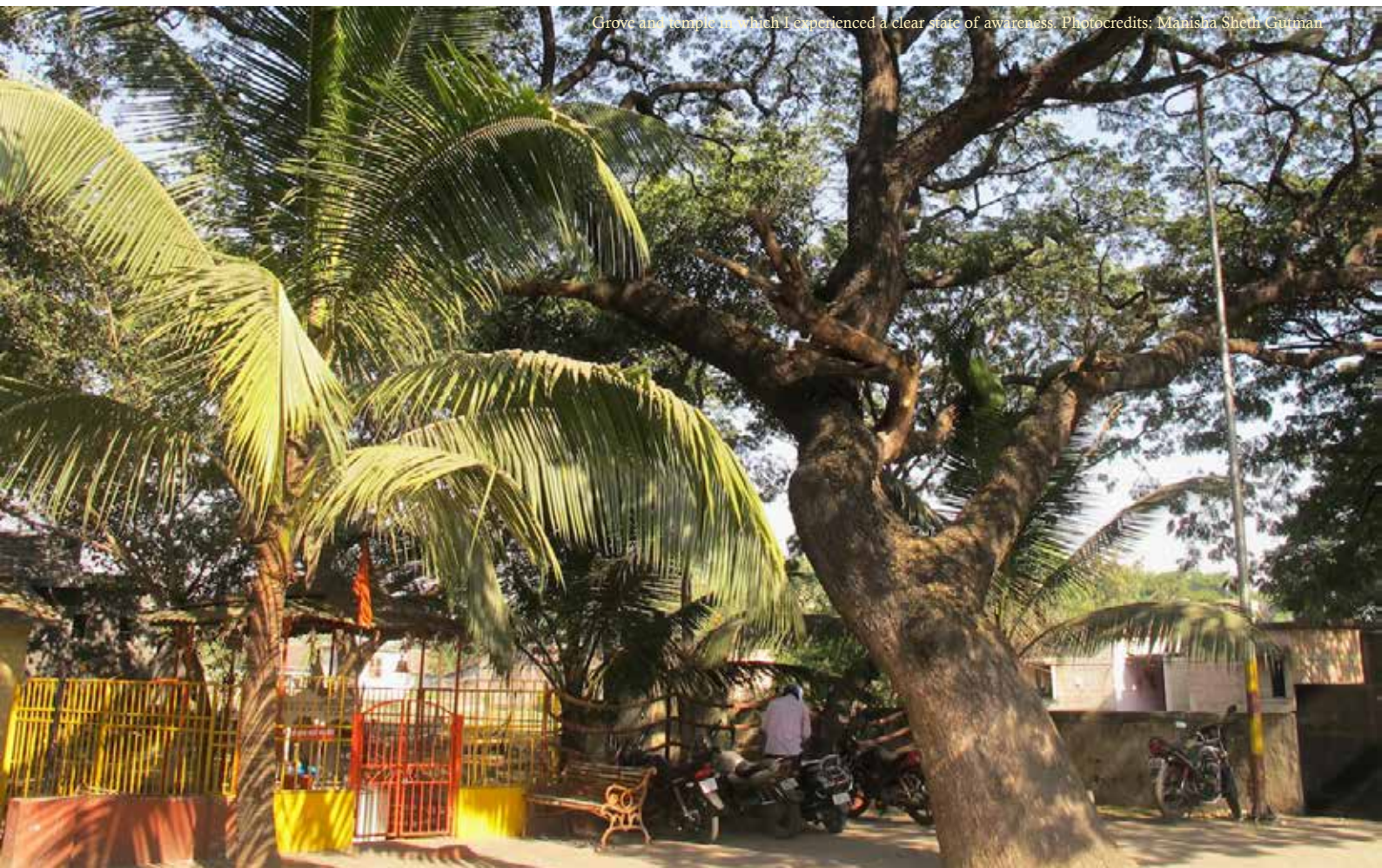
Grove and temple in which I experienced a clear state of awareness.

Will the man-made shrine provide the same bio-physiological experience that the tree offered initially?